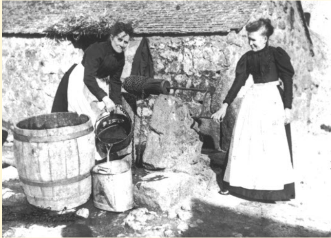
Washing milking buckets from the farm with water drawn from the well or peath, taken at Treen, St Levan about 1895